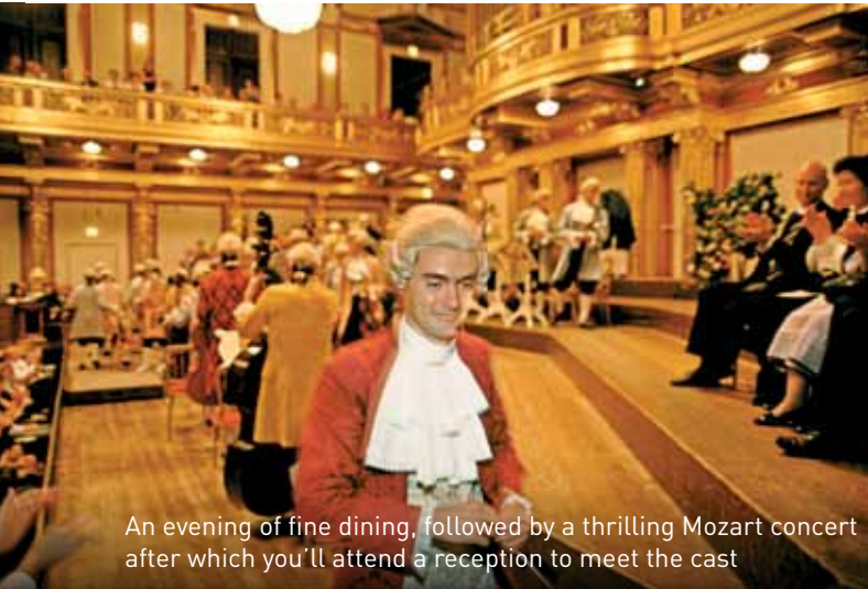
An evening of fine dining, followed by a thrilling Mozart concert after which you'll attend a reception to meet the cast