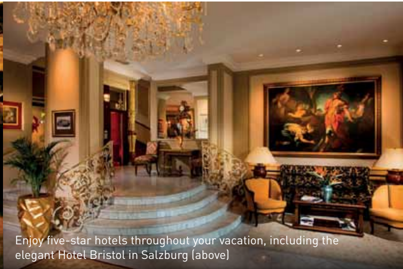
Enjoy five-star hotels throughout your vacation, including the elegant Hotel Bristol in Salzburg (above)

escorted to the Brahms Hall at the Musikverin by horse and carriage. Here, enjoy a Mozart concert and meet the cast during the interval. (BB, AT, SE)