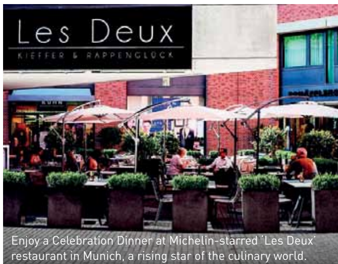
Enjoy a Celebration Dinner at Michelin-starred 'Les Deux' restaurant in Munich, a rising star of the culinary world.